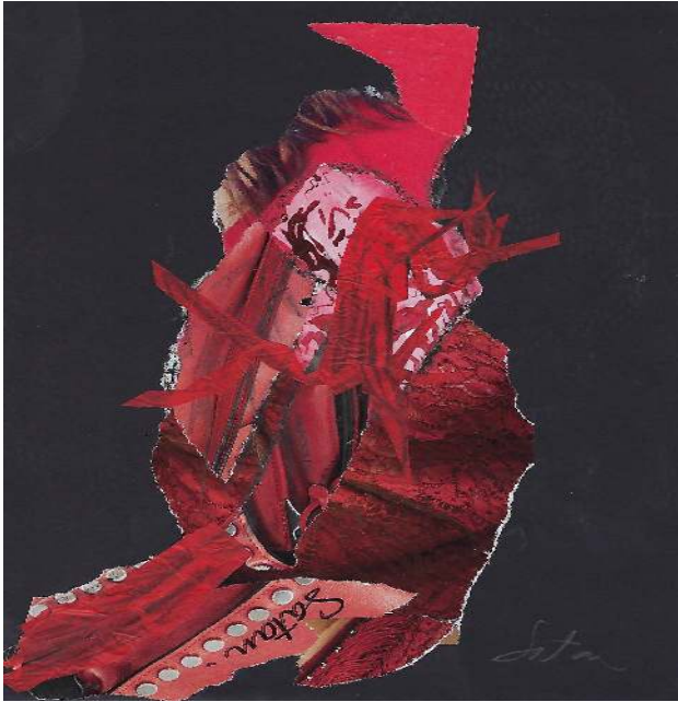
Figure 6 Pam Tait, Sketch for Satan , 2018.