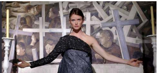
Figure 9 Impermanence, The Ballet of the Nations , 2018, film still.