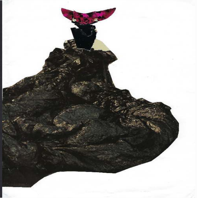
Figure 7 Pam Tait, Sketch for Satan , 2018.